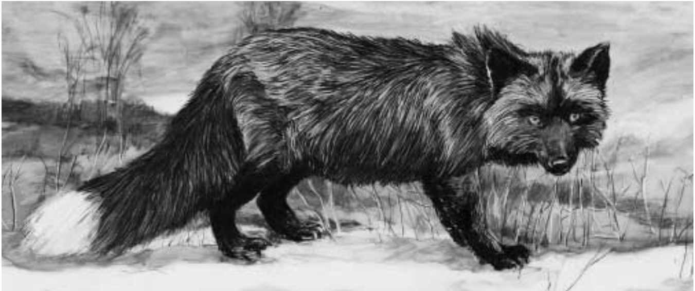
Figure 4. In typical silver foxes, such as those in the founding population of Belyaev's breeding experiment, ears are erect, the tail is low slung and the fur is silver-black, save for the tip of the tail. (All drawings of foxes were made from the author's photographs.)

tion, snarling fiercely at one another as they seek the favor of their human handler. Over the years several of our domesticated foxes have escaped from the fur farm for days. All of them eventually returned. Probably they would have been unable to survive in the wild.